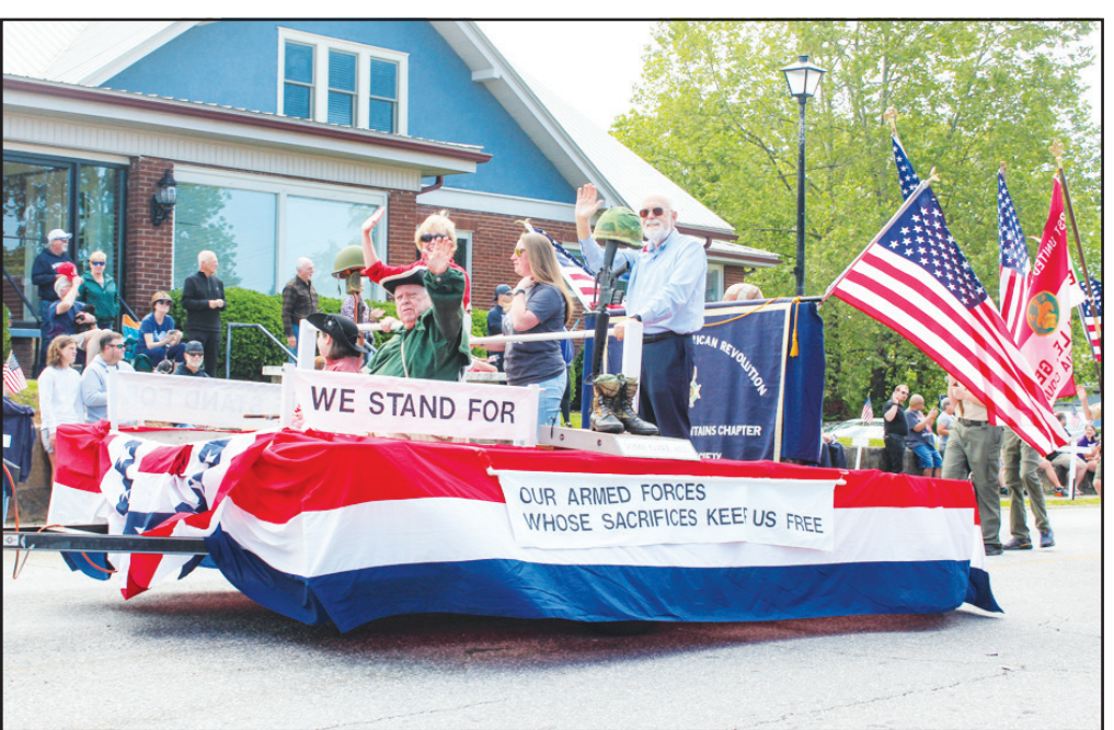
The Sons of the American Revolution entered this patriotic float in the 2023 Memorial Day Parade, which is set to roll through town again Saturday morning.