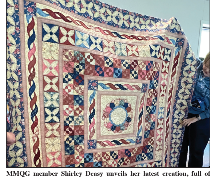
curved applique and sweeping colors

MMQG has more than 160 members, hailing primari-