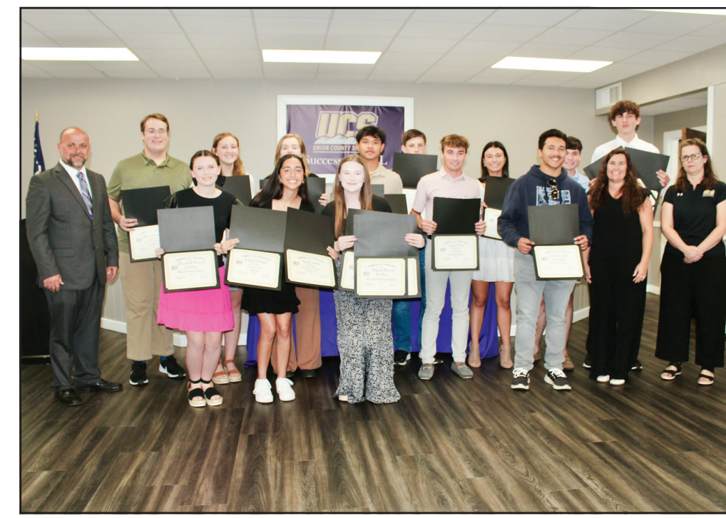
Technology Study Association members received kudos and certificates of appreciation in the Board of Education meeting last week.

he has made a difference when it comes to getting kids ready to join the workforce, and that he's ready to lead UCHS into the future.